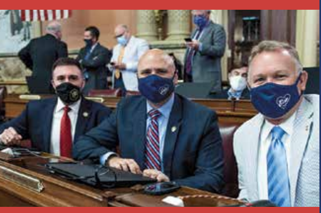
The Erie Delegation working for you in Harrisburg.